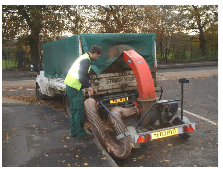
Leaf collection – contributing to street cleanliness

Staff attendance levels continue to improve with the average sickness levels per full time equivalent standing at 3.21 days compared to 3.64 days for the same period (April to August) last year.